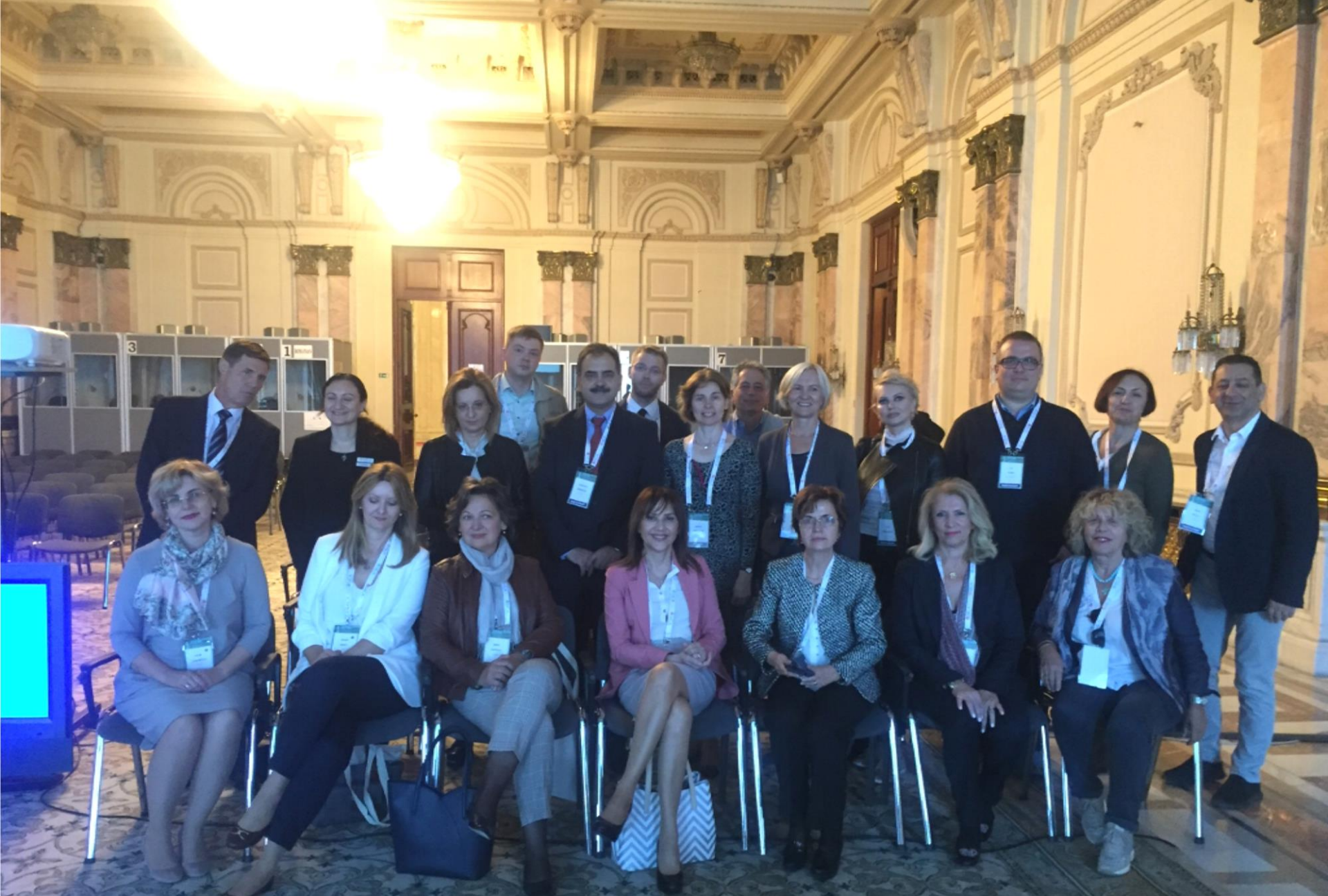
Participants of UENPS members' session 03Oct2018